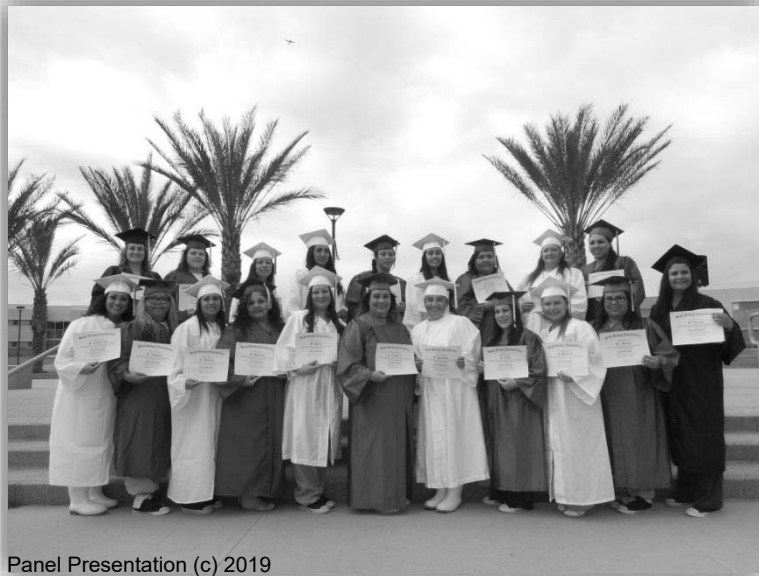
Panel Presentation (c) 2019