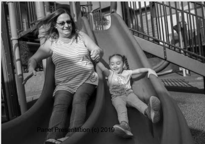
Panel Presentation (c) 2019