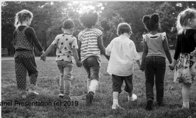
Panel Presentation (c) 2019