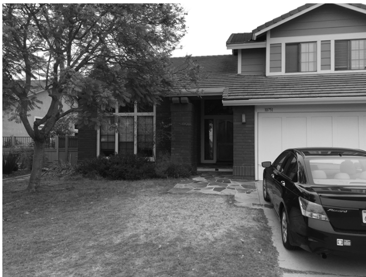
Demonstration: Rowe House, 2002, October