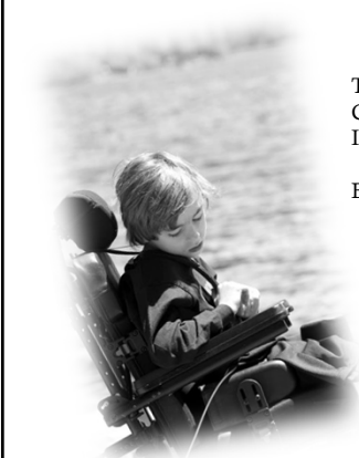
The Psychosocial Consequences of Medical Illness